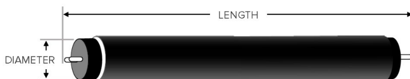
774 775 Figure 1: Dimensions of linear replacement lamps to be reported on the application form. 776